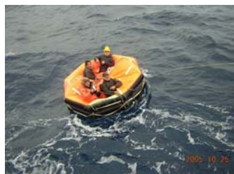
United States Coast Guard's Elev-

The Amver Vessel M/V Cape Nelson rescued four fishermen from their sinking boat 625 nautical miles off the coast of San Francisco, California on October 25, 2005. The skipper of the sailing vessel, along with three others, activated their EPIRB and made distress calls before abandoning ship into a life raft. The